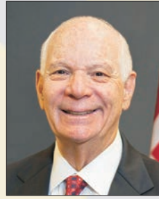
Ben Cardin U.S. Senator