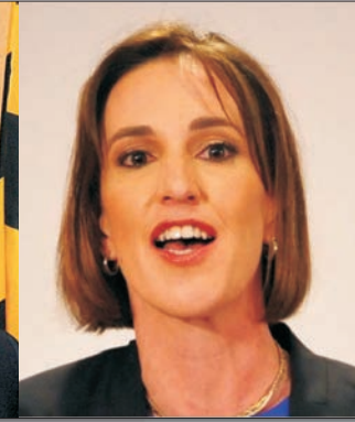
Elizabeth Embry Lt. Governor