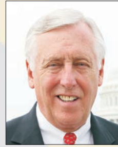
Steny Hoyer Representative in Congress - District 5