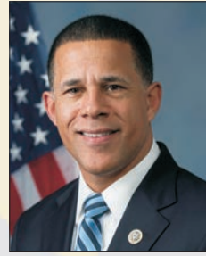
Anthony G. Brown Representative in Congress - District 4